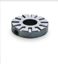
Index plate Item No. 10981 T-6 for core drills with 6 teeth Item No. 10982 T-7 for core drills with 7 teeth Item No. 11009 T-9 for core drills with 9 teeth Item No. 11012 T-12 for core drills with 12 teeth Item No. 11063 T-14 for core drills with 14 teeth