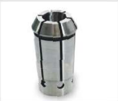
Collet set Item No. 14348 for SVR 20 (Set 6, 8, 12 mm)