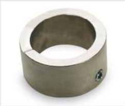
Item No. 10881 Cam for cross rose bits, single flute