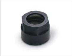
Item No. 10880 Nut for extra collets