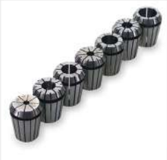
Collet set Item No. 16398 7 pcs. for BKS (8/10/12/14/16/18/20 mm)